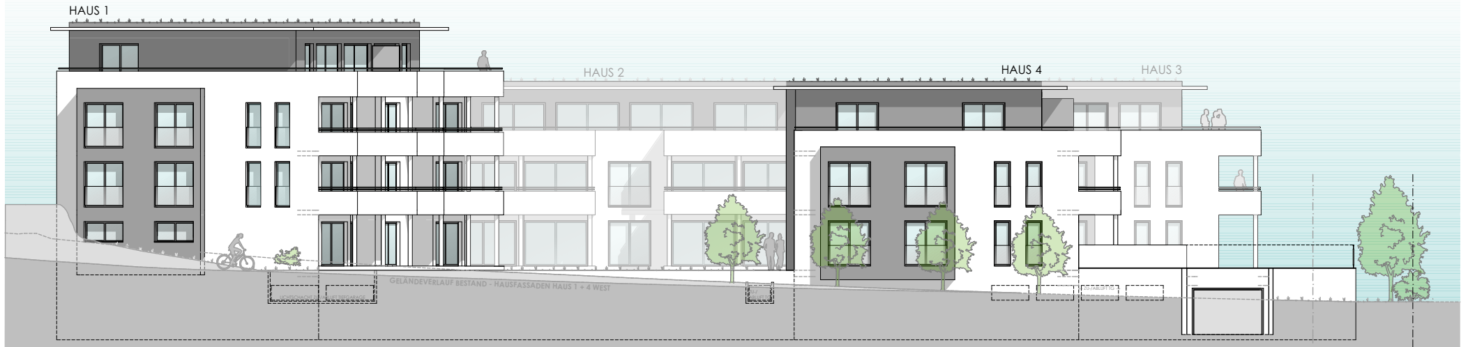
WEST HAUS 1 | 4